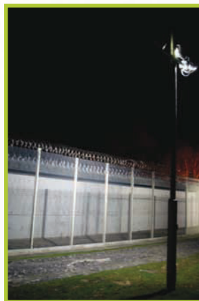
With Raytec lighting

To arrange your lighting consultation or for more information on RAYLUX Urban, please call Norbain on +44 (0) 118 912 5000 , or email vince.bessell@norbain.co.uk