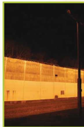
Without Raytec lighting